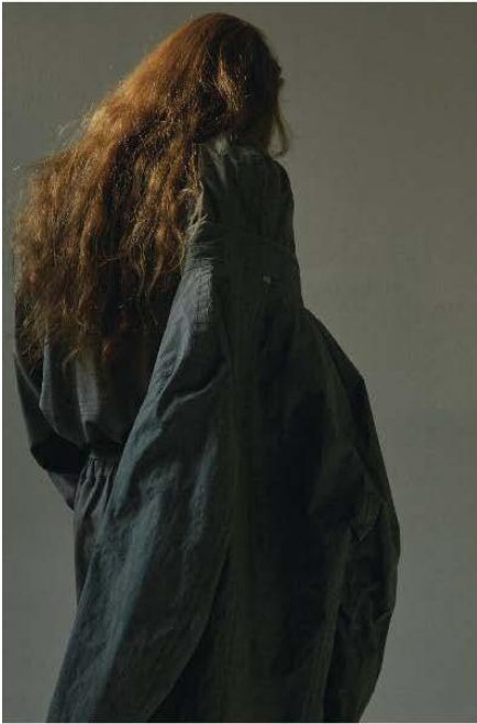
Herno jacket, Issey Miyake jumpsuit. Opposite page, Woodrich shirt, Larwin trousers and shoes, Thomas Pina braces.